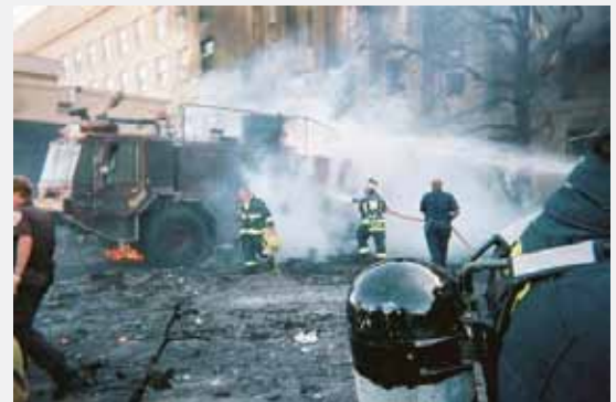
This photograph is one of the first images of the Pentagon shortly after the terrorist attack.

Immediately after the attacks, first responders, including police officers, firefighters, members of the military, and emergency medical workers, raced to the attack sites to rescue survivors and offer help to people at the sites. Many first responders were hurt or killed as a result of the attacks on September 11, 2001.