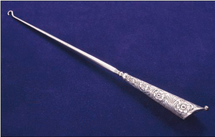
1885, National Museum of American History, Behring Center.

Hint: the woman in Dakota Dugout lists it among the things she took with her to Matt’s cave in the earth.