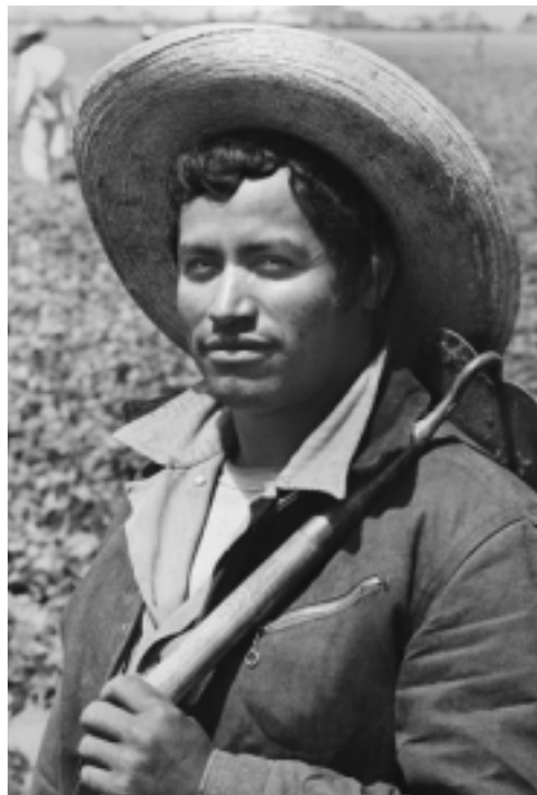
Leonard Nadel's photograph of a bracero worker in a strawberry field near Watsonville, California

From 1942 to 1964, the bracero program brought more than 4.5 million Mexican nationals to the United States. Mexican peasants, desperate for cash