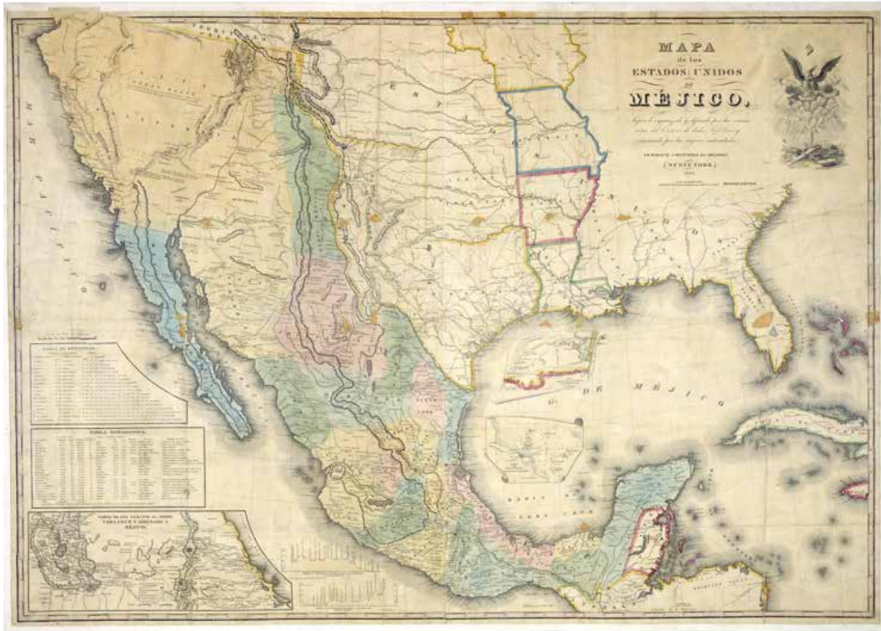
Map of the United States of Mexico, 1847, appended to the Treaty of Guadalupe Hidalgo