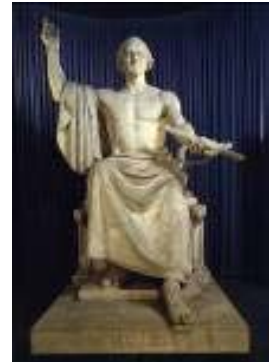
A statue of George Washington. This statue is at the National Museum of American History.

Unfair/Unfairly: to not treat people equally