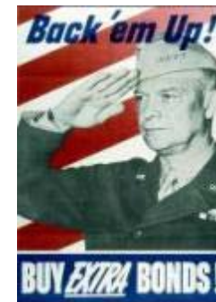
General Dwight D. Eisenhower during World War II.