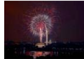
Fireworks on the fourth of July in Washington, DC

Freed: to be set free; to be allowed to live without control from others. Abraham Lincoln freed the slaves.