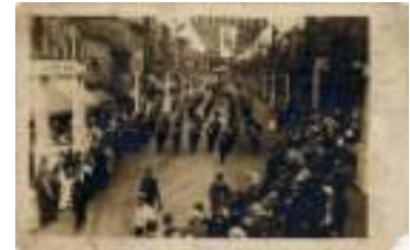
A parade on the 4 th of July.

Pursuit of Happiness: seeking a happy life