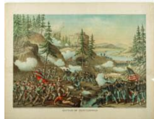
The Civil War battleground of Chattanooga, Tennessee.

Battlegrounds: places where people fight during a war