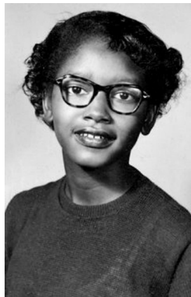
Claudette Colvin, Archive PL / Alamy Stock Photo

The Chicago Defender (National edition), March 26, 1955