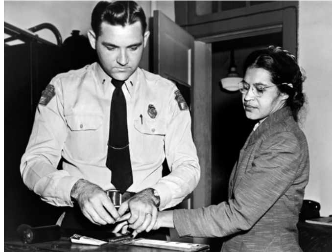
Montgomery police officer takes Rosa Parks's fingerprints following her arrest as a boycott organizer in February 1956.

Nine months after Claudette Colvin's arrest, local activist Rosa Parks took similar action. She refused to give up her bus seat to a white rider and got arrested. Colvin's actions raised awareness, but Parks's actions set off a boycott of the Montgomery bus lines . Thousands of Black residents rode the bus to work, often for white employers. After Parks's arrest, though, they refused to ride for an entire year.