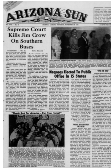
Arizona Sun , November 22, 1956.

The Montgomery bus boycott went on for more than a year after Rosa Parks's arrest in December 1955. In that time, the NAACP filed a civil lawsuit that claimed Montgomery's segregated bus system violated the 14th Amendment of the U.S. Constitution. That amendment ensures equal protection under the law for all U.S. citizens. Led by attorney Fred Gray, the lawsuit ( Browder v. Gayle ) tried to overturn the law that allowed segregated transportation in Montgomery.