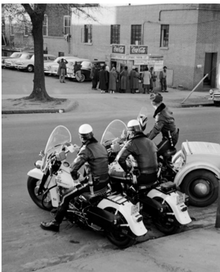
Montgomery police monitor bus boycott participants waiting for carpools, 1956.

Claudette Colvin rode a crowded bus home from Booker T. Washington High School on March 2, 1955. She sat behind white people in the “colored” section, but refused to give up her seat to a white woman who wanted to sit in the same row. The bus driver called the police. Minutes later, white Montgomery officers boarded the bus and arrested her. Read the report filed by the officers and then compare it to Claudette Colvin's memory of her arrest.