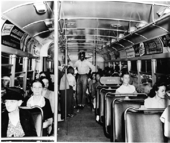
A segregated streetcar in Birmingham, Alabama.